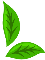
GREEN - LEAF