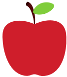
RED - APPLE